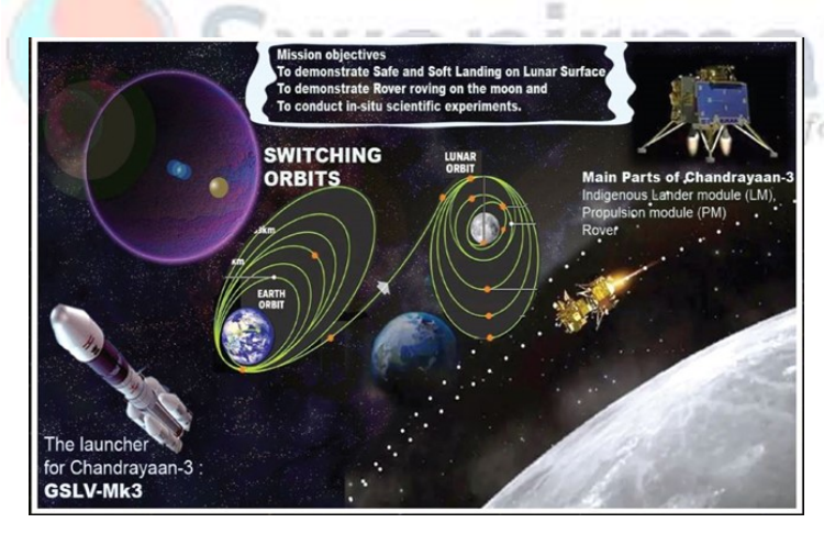
Fig 2. Chandrayaan 3 Modules and Objectives [4]

Vikram Lander: The lander is also generally boxshaped, with four landing legs and four landing thrusters. It has a mass of 1752 kg, including 26 kg for the rover, and can generate 738 W using sidemounted solar panels.