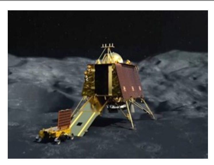
Fig 1. Vikram Lander and Pragyan Rover

Vikram Lander: The lander is also generally boxshaped, with four landing legs and four landing thrusters. It has a mass of 1752 kg, including 26 kg for the rover, and can generate 738 W using sidemounted solar panels.